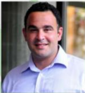
Director of Project SAM (Smart Approaches to Marijuana) and author of "Reefer Sanity"